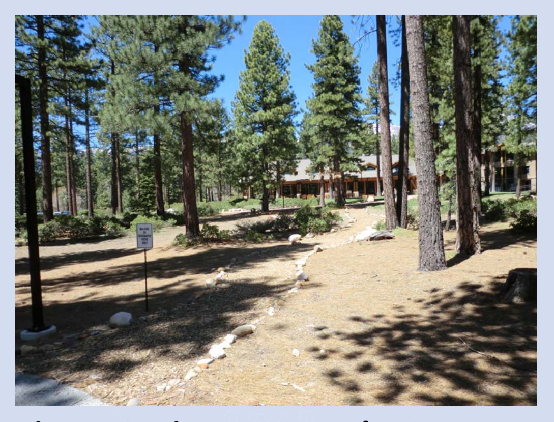
Administrative Permit Case Number WADMIN21-0004 Classical Tahoe